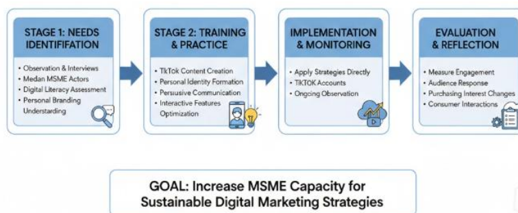
Figure 1. Research Stages

This study uses a participatory mentoring approach that is carried out in several systematic stages. The first stage is the identification of needs through observation and interviews with MSME actors in Medan City to determine their level of digital literacy and understanding of personal branding. The second stage is the implementation of training and practice in creating TikTok content that focuses on personal identity formation, persuasive communication techniques, and optimization of interactive features [10]. The third stage was implementation and monitoring, where participants directly applied personal branding strategies to their TikTok accounts. The final stage was evaluation and reflection, which measured developments in engagement, audience response, and changes in purchasing interest based on consumer interactions. Through these stages, this study not only aimed to produce empirical findings but also to provide practical impacts in the form of increasing the capacity of MSME players in managing sustainable digital marketing strategies [3].